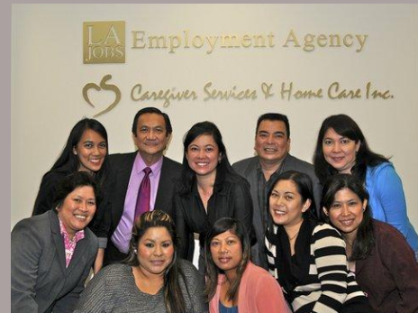
CAREGIVER SERVICES & HOME CARE, INC. TEAM